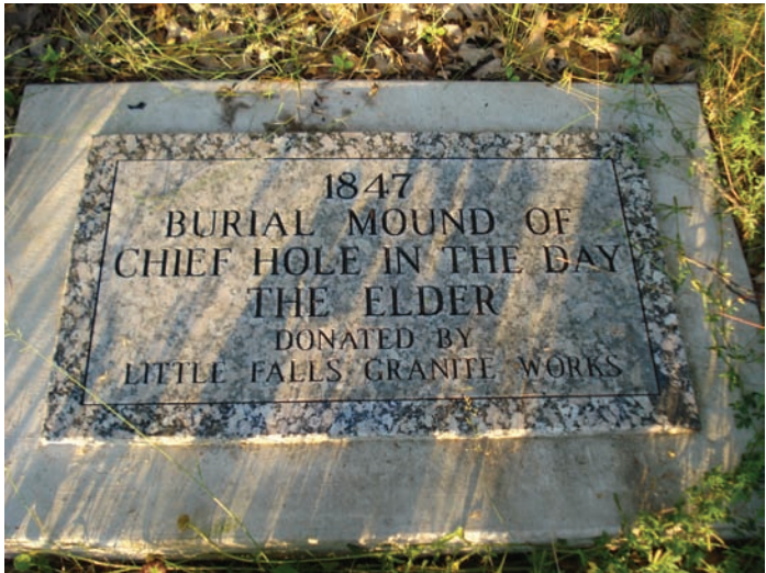
Grave marker of Chief Hole in the Day I. This marker replaced the original marker, which was destroyed by vandals in 2006. It was placed at the bluff site by the Little Falls Granite Works in 2007.

caused the depression." (27) Provided the boys had found the actual gravesite, this could be considered one of the most direct and severe grave disturbances, except for an incident that occurred much earlier that made the boys' digging an empty exercise.