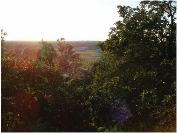
View from Hole in the Day's marked gravesite, looking northwest, July 16, 2010.

south slope of the bluffs in 1959 and an industrial park, appropriately called the Chief-Hole-in-the-Day Addition, was platted at the foot of the bluff, just west of Highway 371, by the City of Little Falls in 2002. Both developments garnered