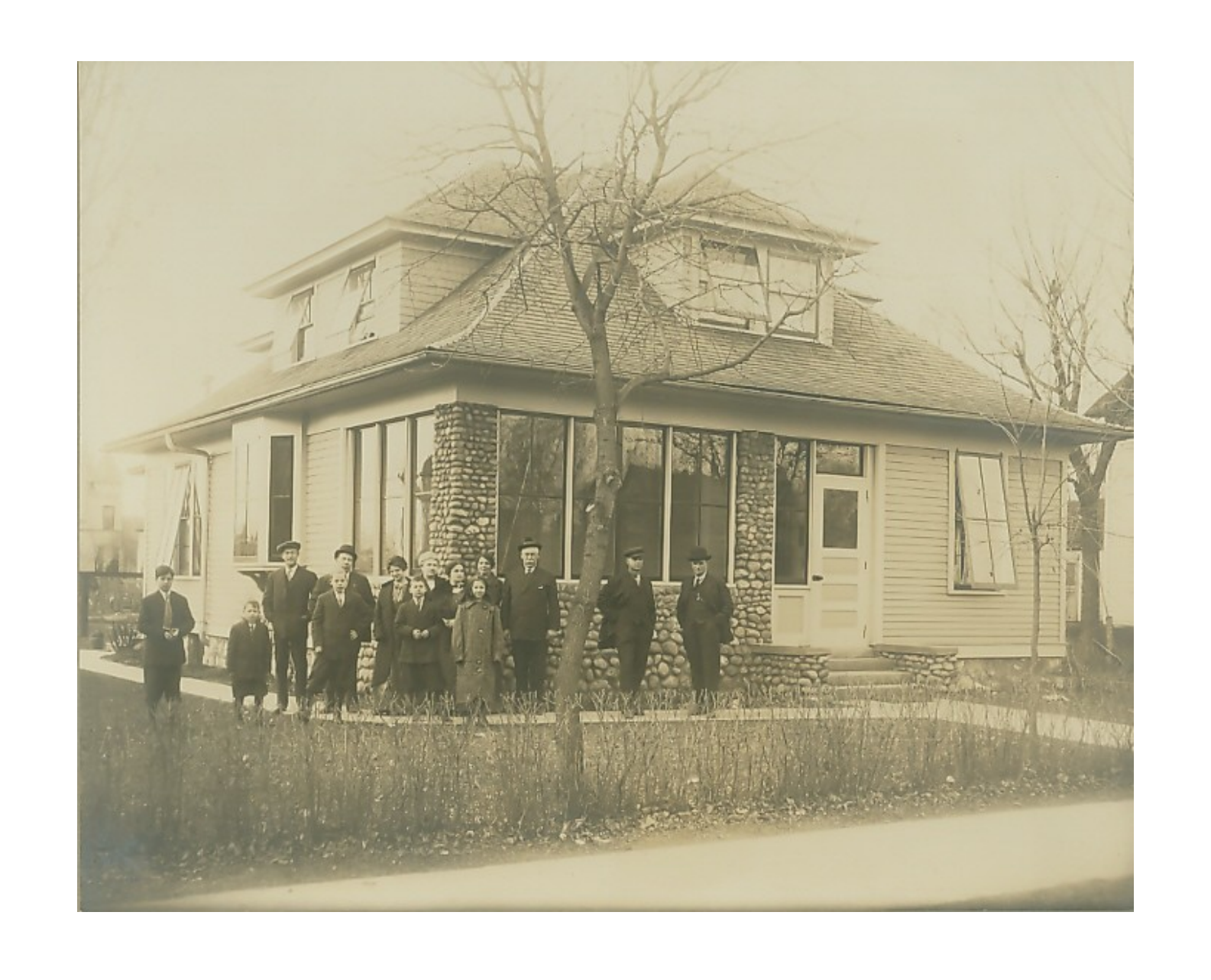
Clarence B. Buckman House, 4<sup>th</sup> Street SE, Little Falls, MN.