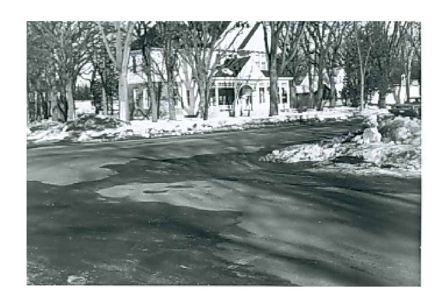
Dr. E. L. Fortier Home, Broadway & 6<sup>th</sup> Street NE, Little Falls, MN.