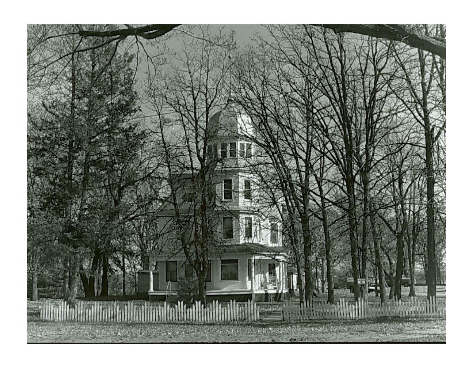
Motley Castle, Motley, MN.