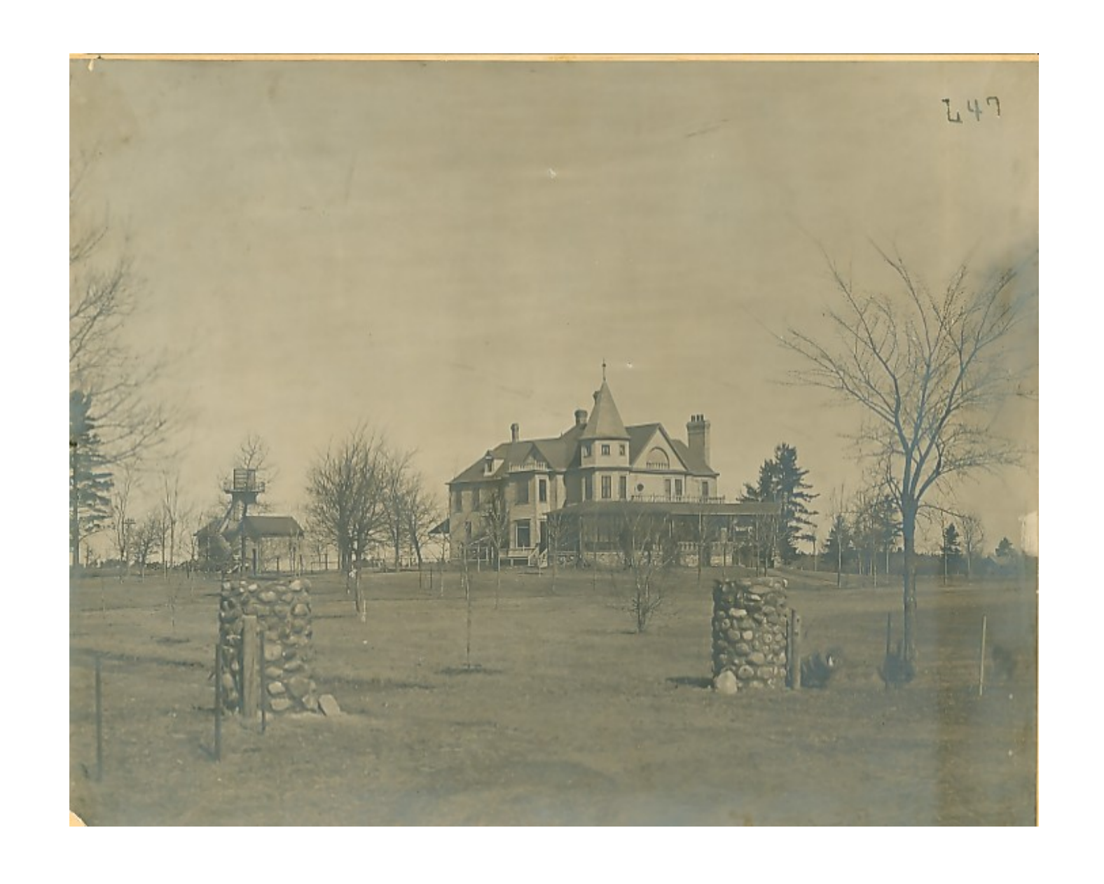
Major Ashley Morrill House, Little Elk, 1905.