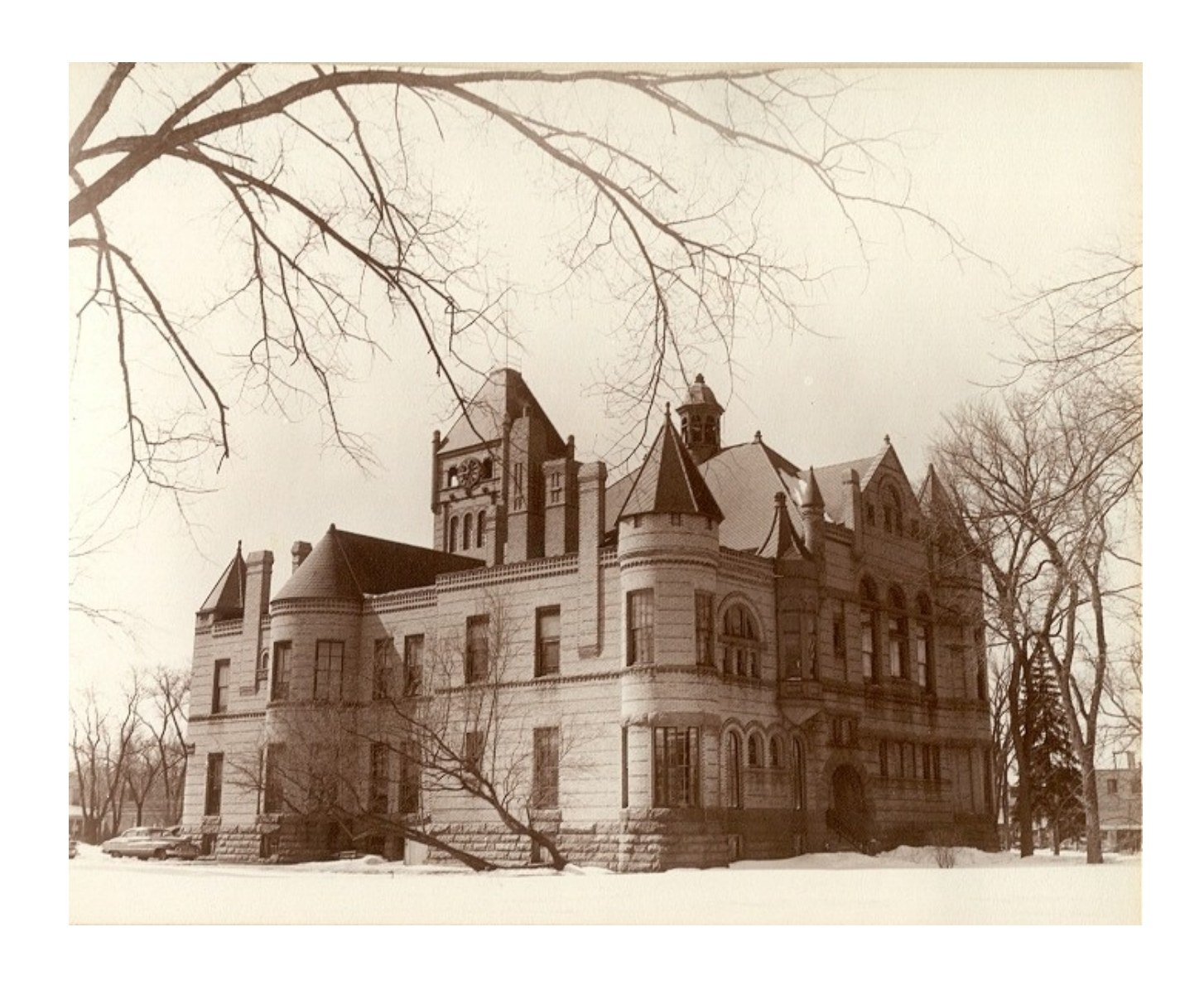
Historic Morrison County Courthouse, photo taken 1952.