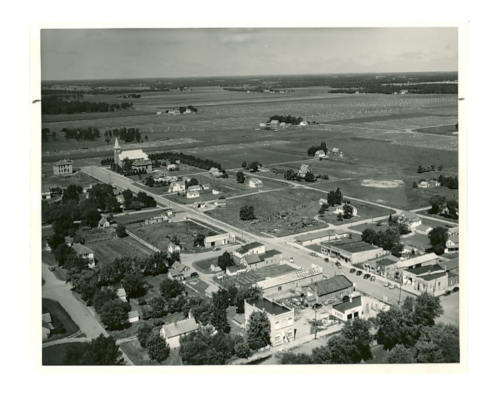
Bowlus, 1951