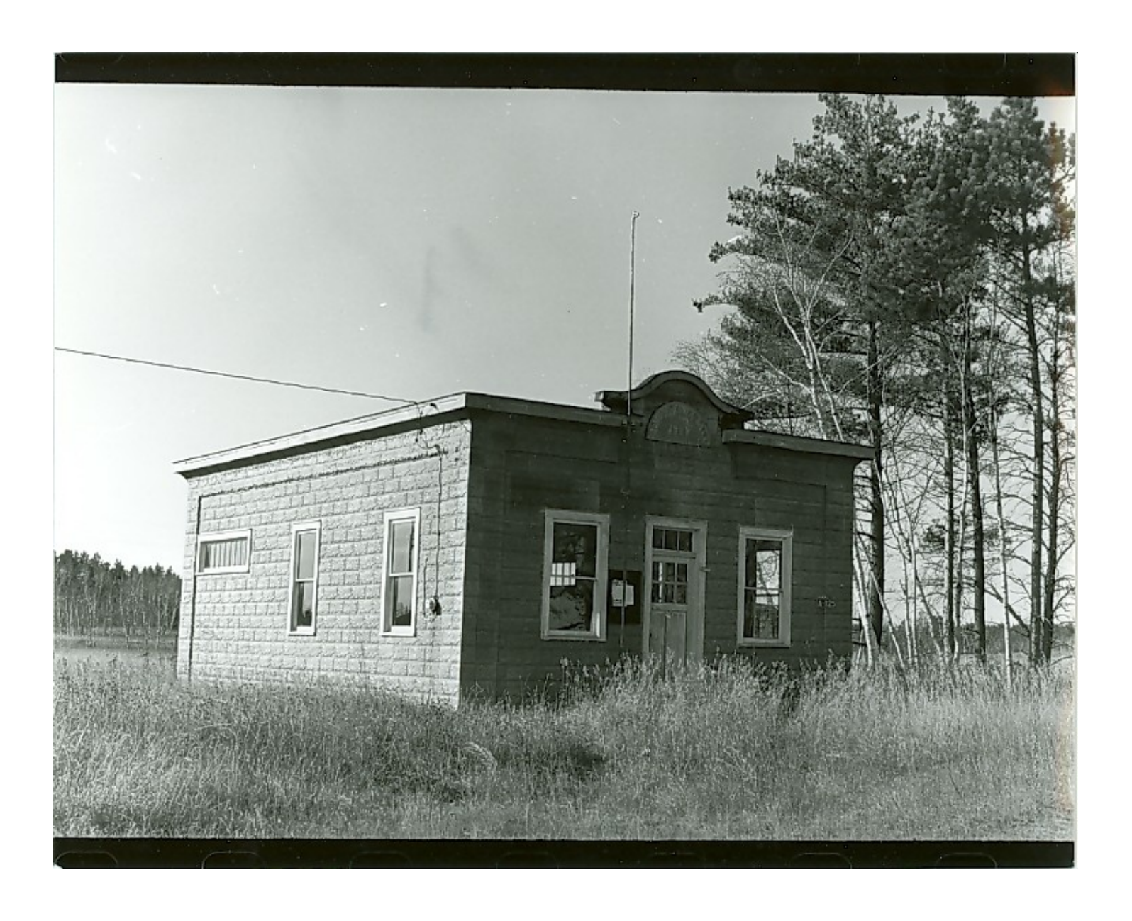
Clough Town Hall, 1980.