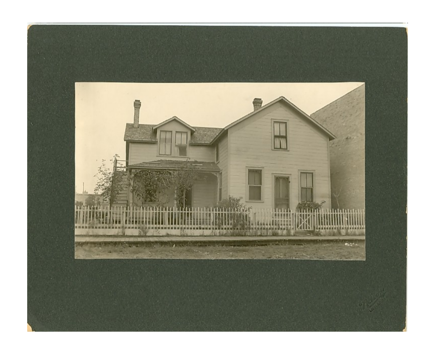
Muske House, 1<sup>st</sup> Avenue SE, Little Falls, 2 blocks from dam.