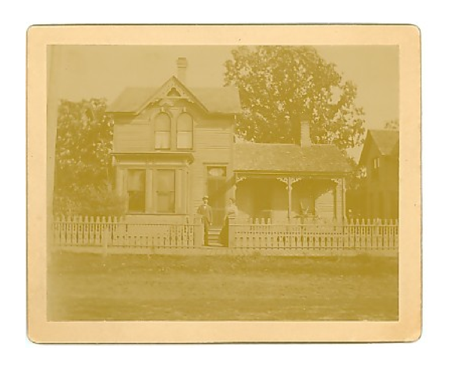
Walter Folsom House