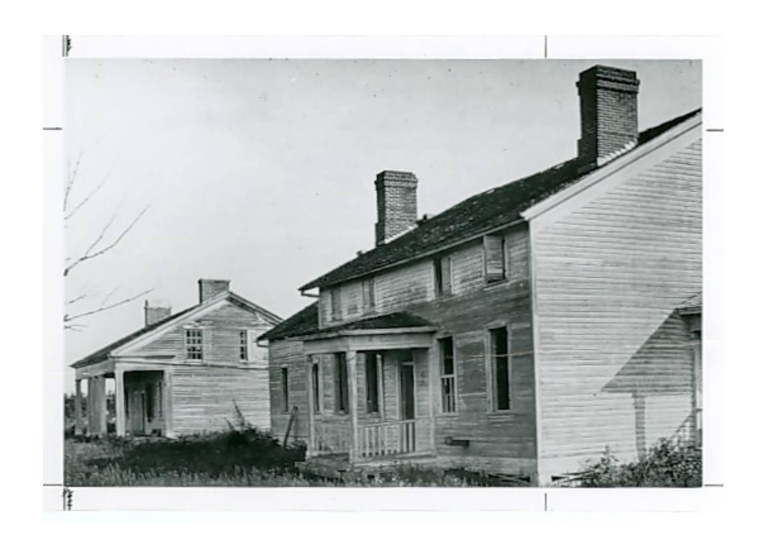
Buildings at Old Fort Ripley.