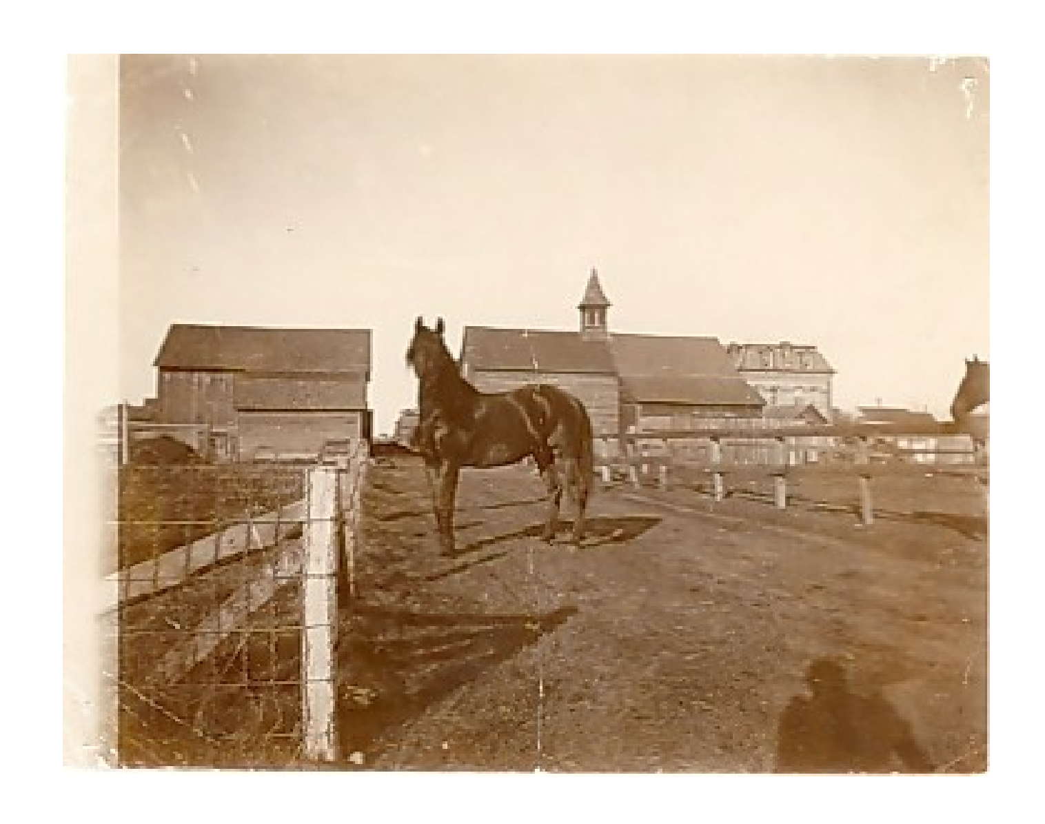
R. A. Randall House in Background