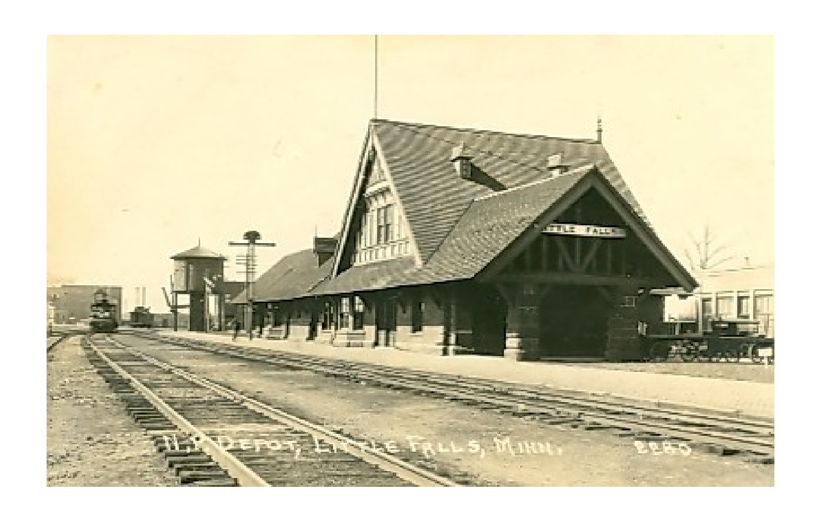
Northern Pacific Railroad Depot, Little Falls, MN.