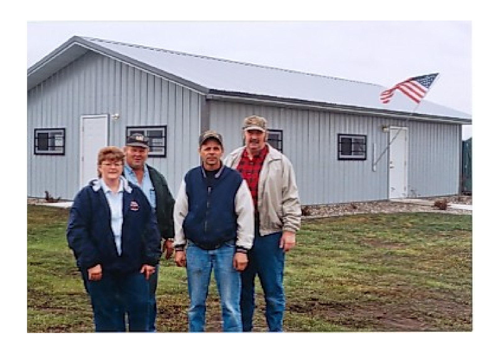
New Buh Town Hall. Township officials pictured, c. 2004.