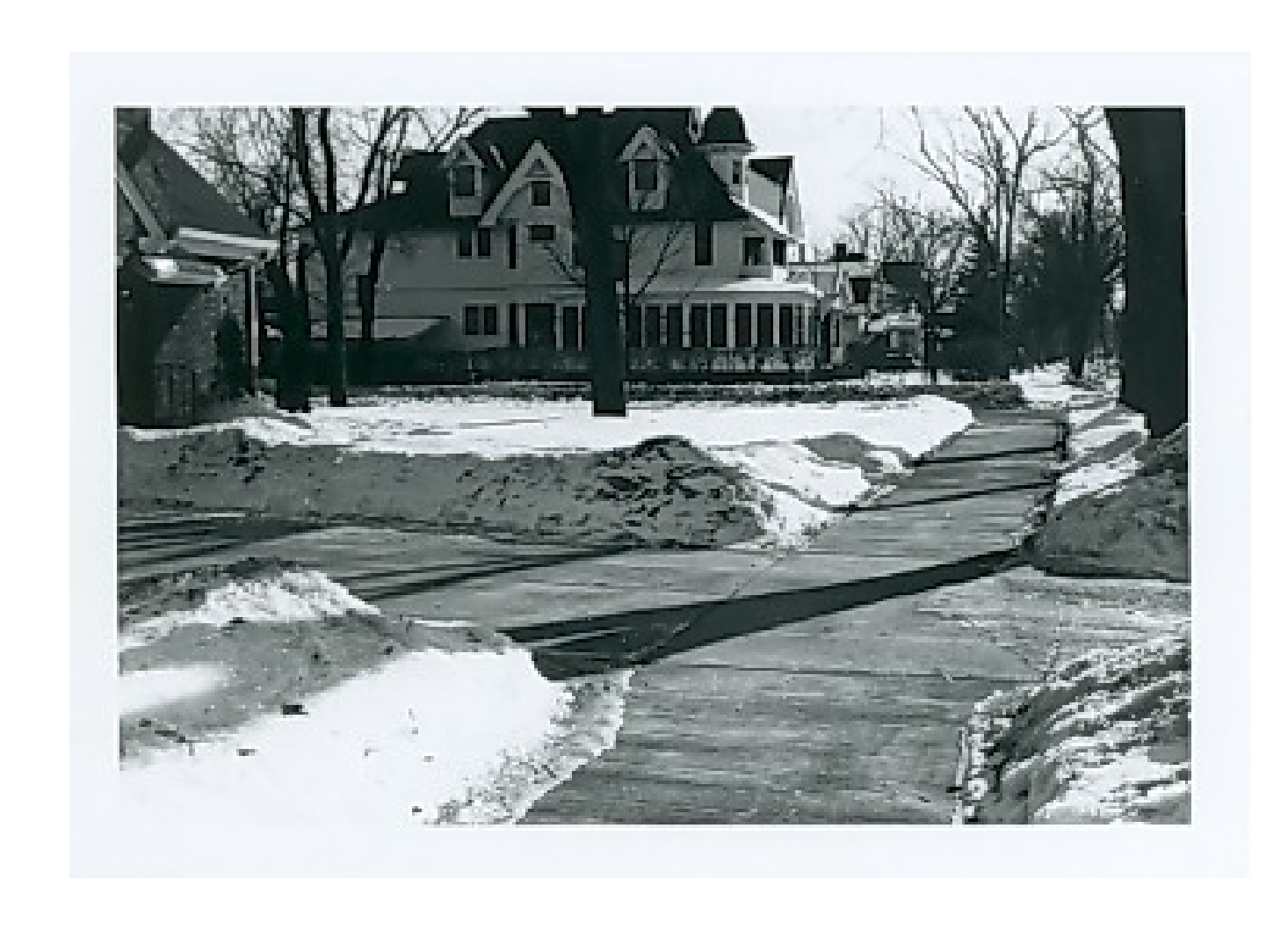
Davidson House – 301 SE 3<sup>rd</sup> Street, Little Falls, MN, 1973