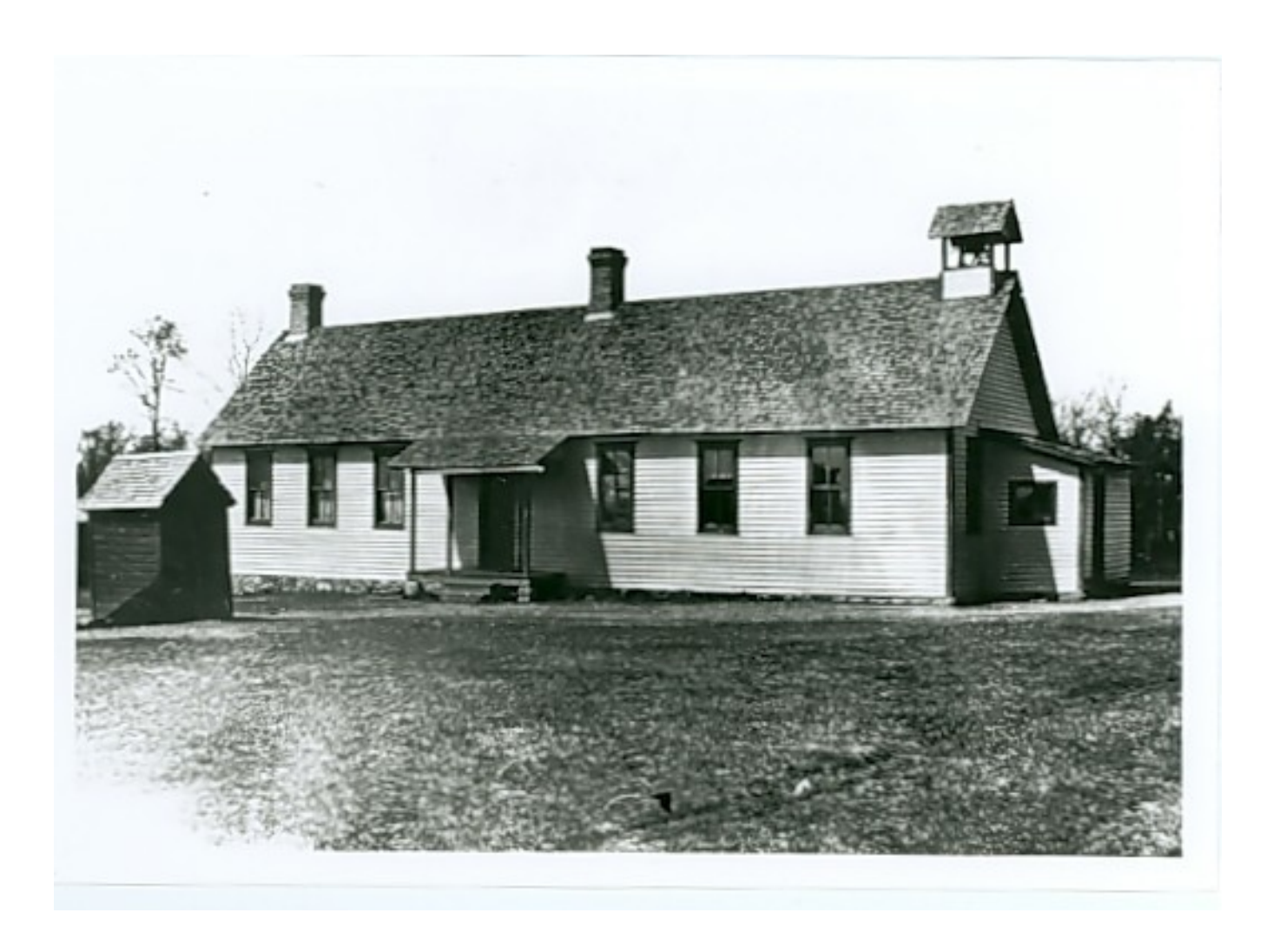
School District #31, Culdrum Township.