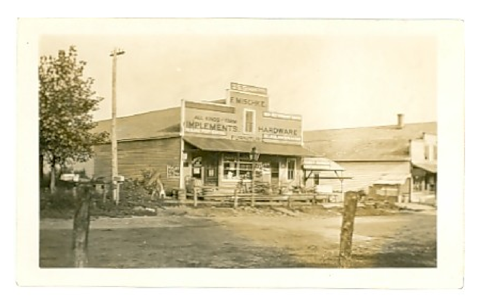
F. Mischke Implement & Hardware, Buckman, MN.