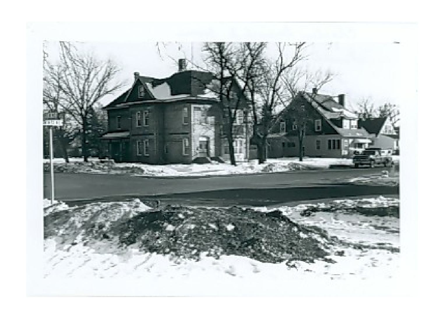
Charles Gravel I Home, 4<sup>th</sup> Street & 1<sup>st</sup> Avenue NE, Little Falls, 1973