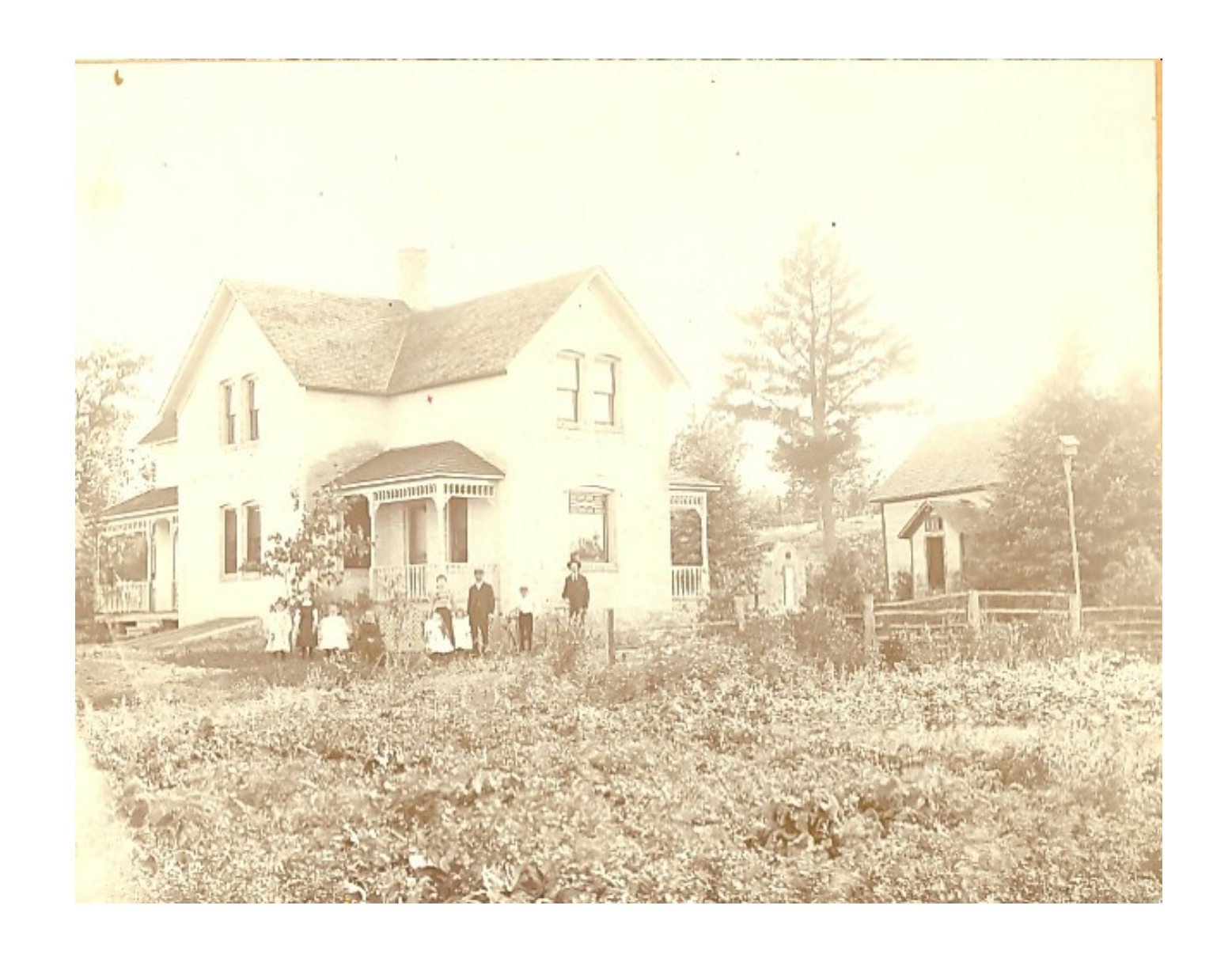
House in Swanville, December 17, 1900.