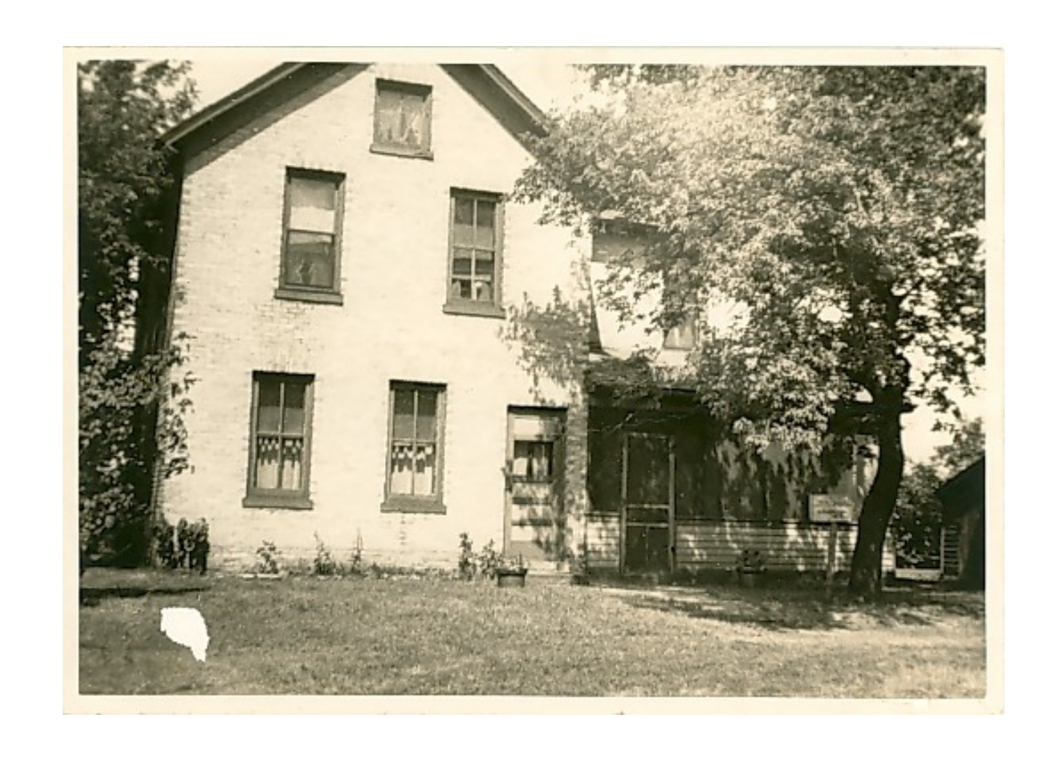
The Landmeier Home, 414 SE 7<sup>th</sup> Street, Little Falls, MN, 1941.