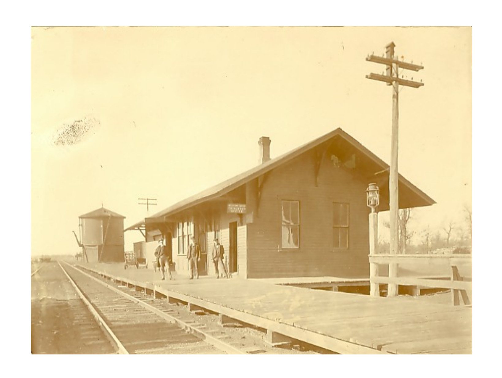
Royalton Depot, March 1900.