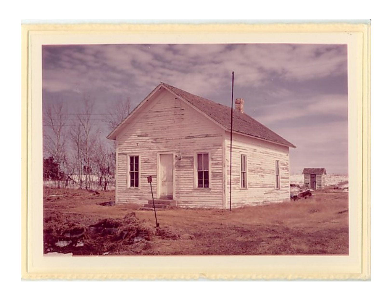
Belle Prairie Town Hall